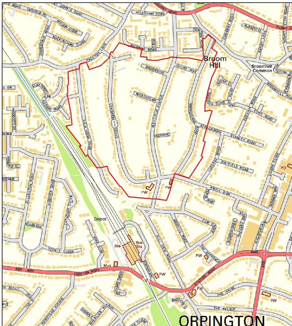
The Knoll ASRC Boundary (not to scale)