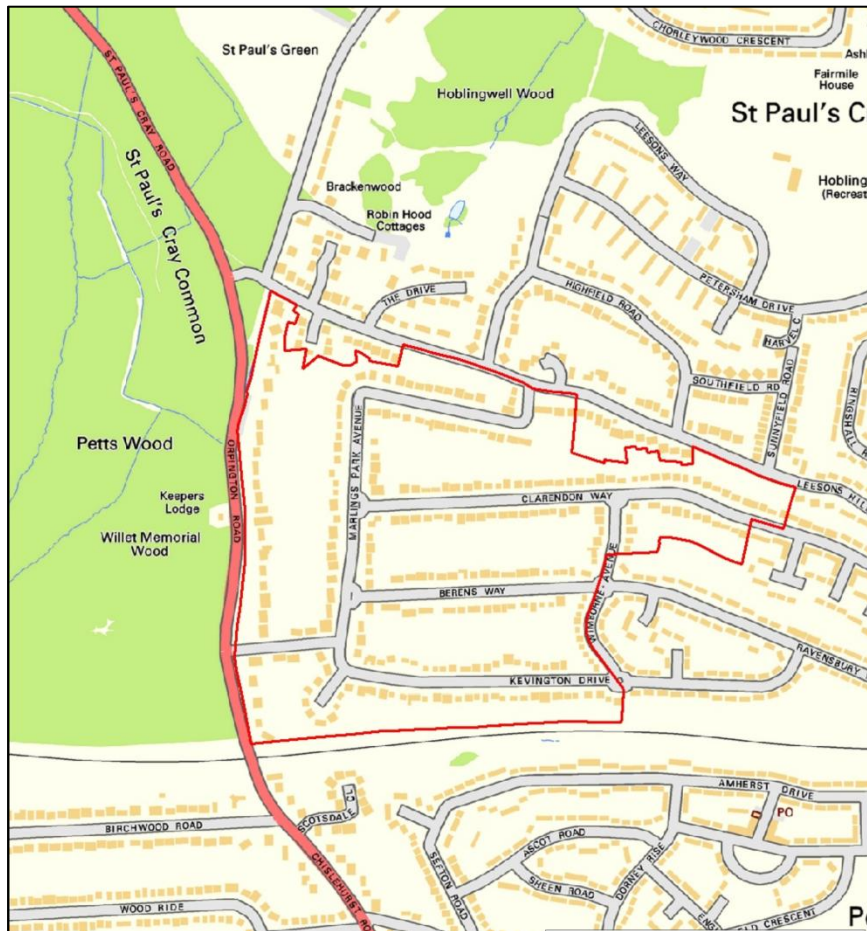
Marlings Park ASRC Boundary – Not to scale