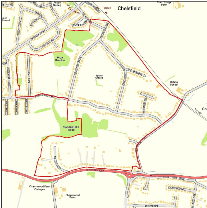
Chelsfield Park ASRC Boundary – Not to Scale